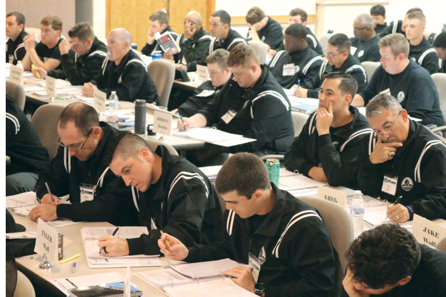
Students spend four hours of instruction each day in the Jackie Robinson Room and are given tests at regular intervals to chart their progress.

If you asked a million people what they do for a living, one of them might say professional baseball umpire. There are only 310 of them in the United States and Canada, 76 in Major League Baseball and 234 in the minors.