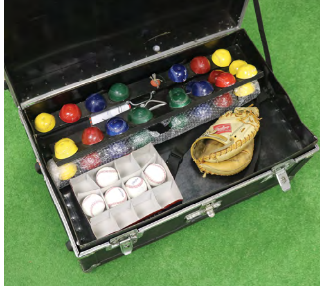
The colored-baseball boards in this trunk are sometimes laid in front of home plate as an aid for calling balls and strikes.