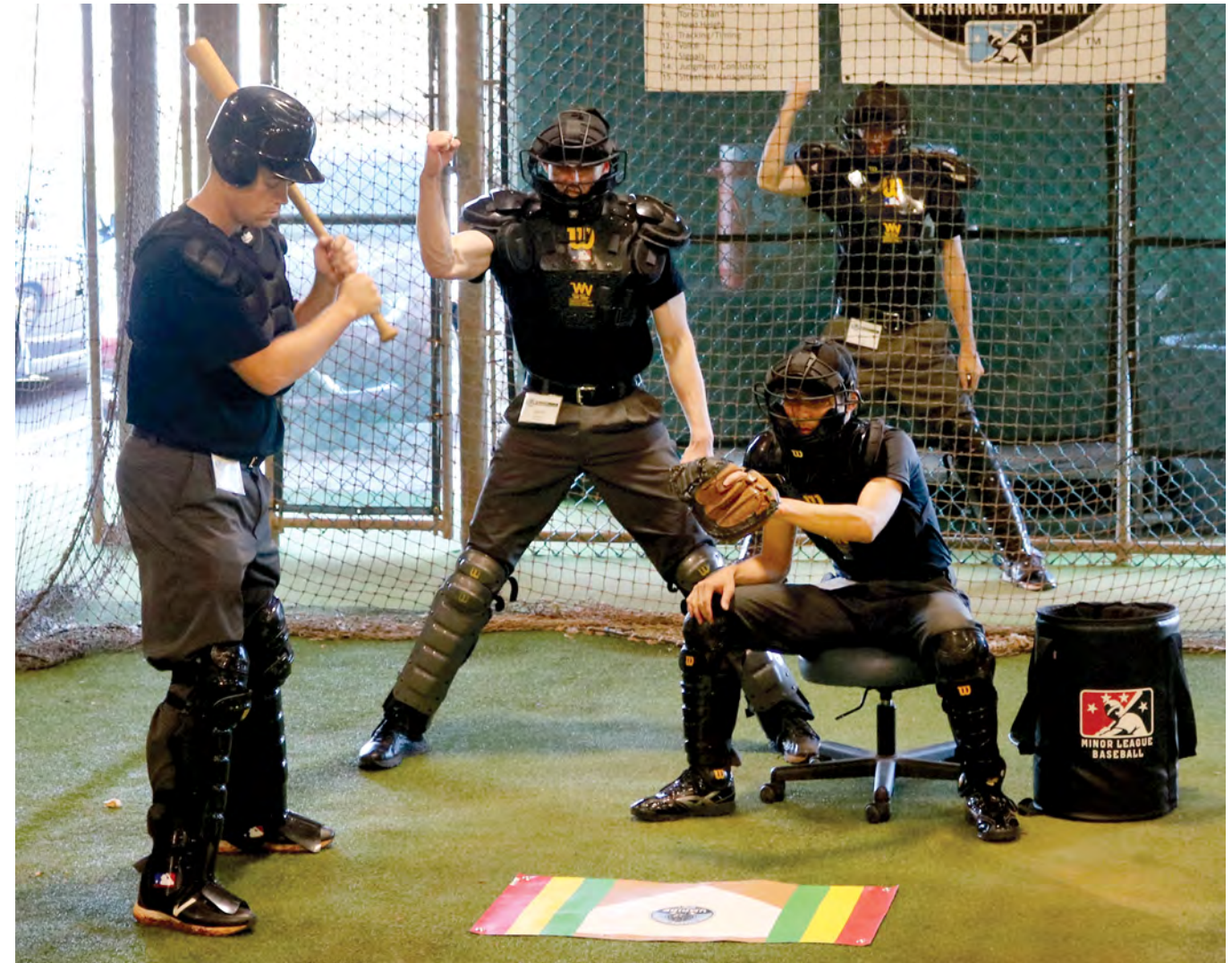
Students rotate positions to simulate game conditions. One student, on deck in the back, gets in a bit of extra practice.

In the minors, umpires are paid monthly, for either a three-