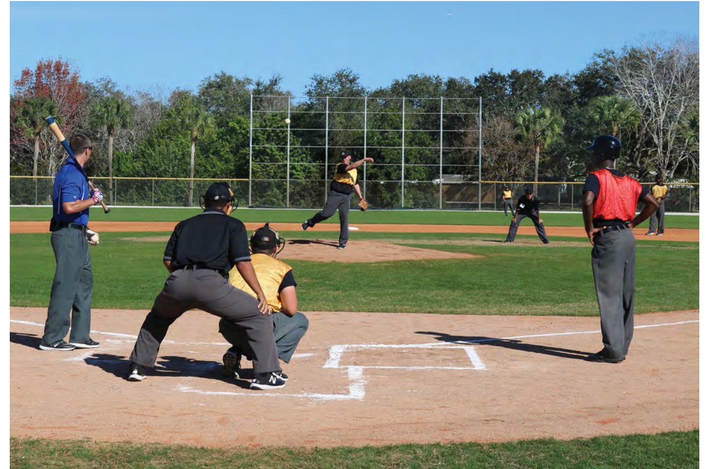
The Academy teaches the two-umpire system, one ump at home and one covering the bases, which is used in most minor league games.

to umpiring, that anybody could do as good a job, maybe better. They’re wrong. The variables and responsibilities are endless, requiring hours of study and practice as well as a sharp focus on every play. Other classroom topics are professionalism; duties before, during and after the game; illegal equipment; interference; injuries and dealing with venom-spewing managers, to name a few.