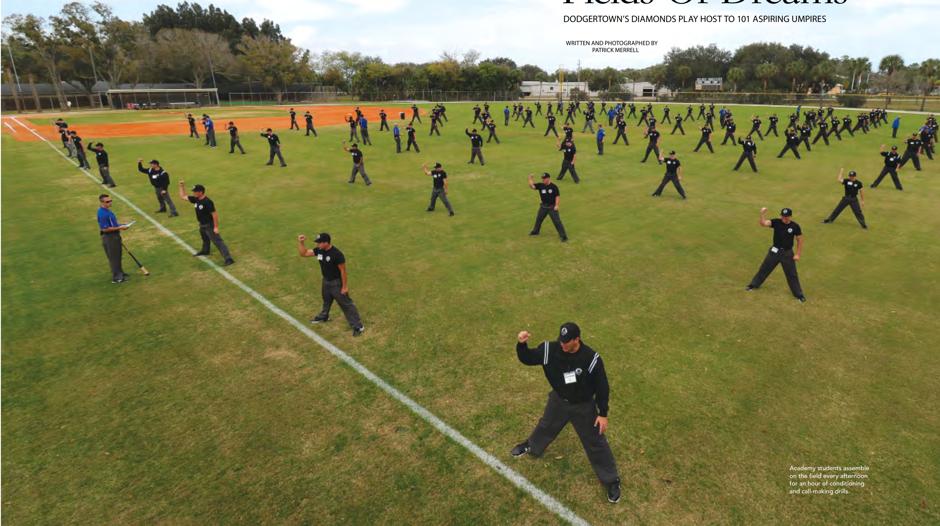
Academy students assemble on the field every afternoon for an hour of conditioning and call-making drills.